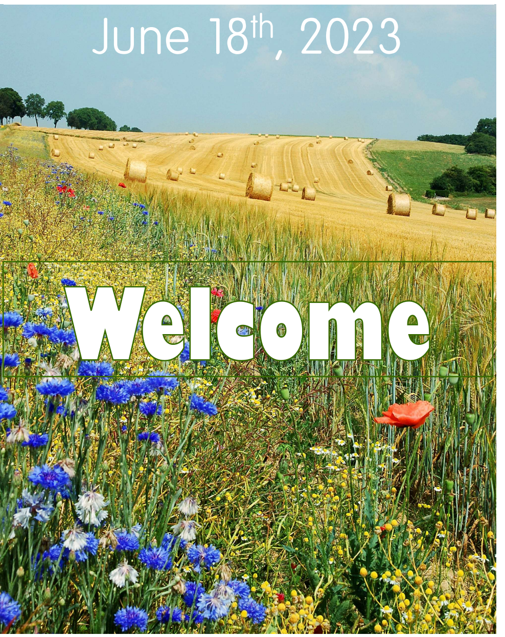
Let us not become weary in doing good, for at the proper time we will reap a harvest if we do not give up. Galatians 6.9